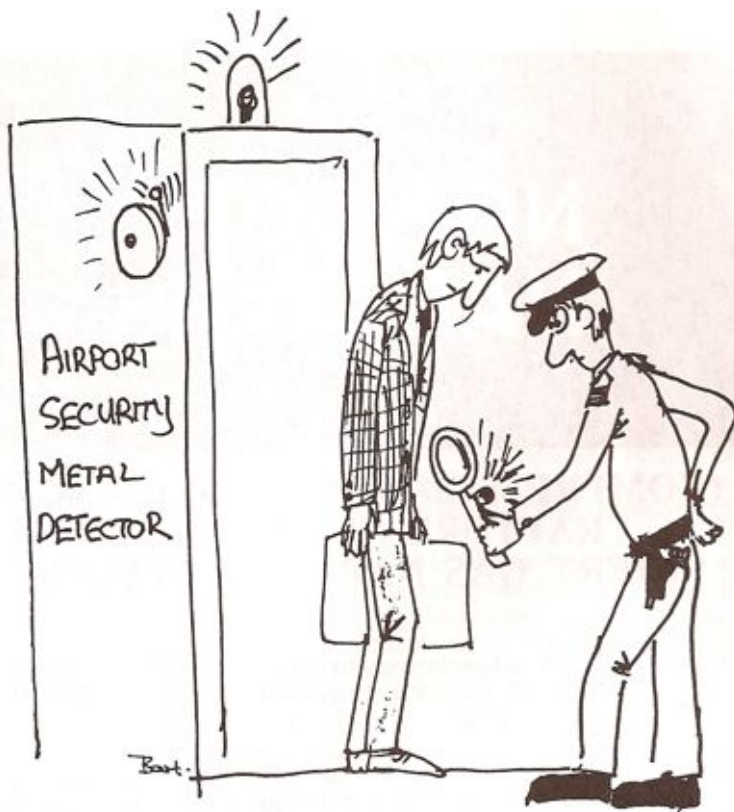
Replacement hips may cause problems.

iously desirable. Most sensible divers should avoid dives deeper than 40 metres, avoid dives requiring decompression, not approach the no-decompression limits and ascend slowly. It is likely that the longer duration dives permitted with many dive computers, together with the increased number of dives and the ability to dive close to the edge of decompression commitment, now makes this disorder more likely for recreational divers.