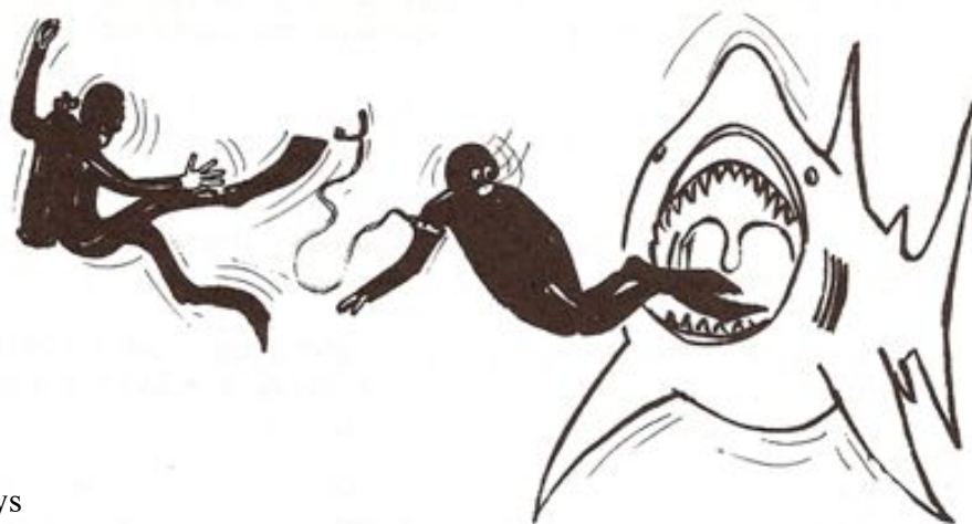
Fig 34.3 But not always